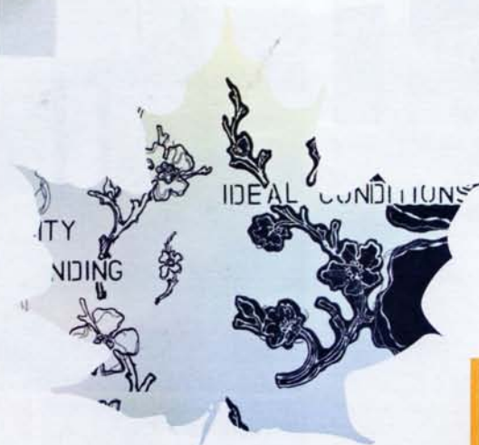
Wall-surface details from different rooms in the Eco-Suite.

Six years ago, Canadian developer Tridel announced it would embrace sustainability in its future building projects. That promise was first realized in 2006 with the opening of Element, a Toronto condo cooled by Lake Ontario water, and again last May with Eco-Suite, a sales-model unit inside Element that is finished to a higher level of decoration—and greenness—than the other homes in the